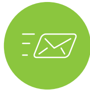
Sending Service Provider