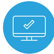
Receiving Service Provider